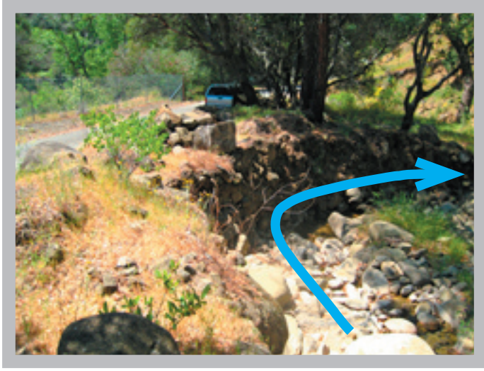
Thompson Creek: Upstream view of curve at access road to Monticelllo Dam