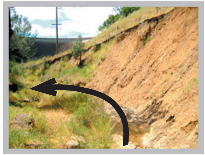
Thompson Creek: Upstream view of eroding bank just above access bridge to Monticello Dam