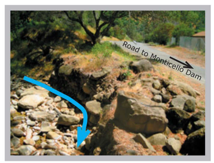
Thompson Creek: Downstream view of curve at access road to Monticello Dam. Same site as image above.